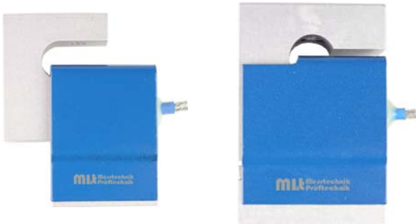
Load cell SM 1000 N