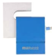
SM Load Cell