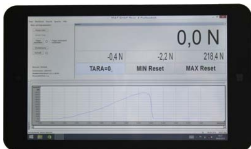
CMS PC software with presentation of measured values